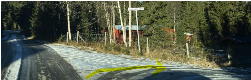
Turn right at “Skolmsætervegen”